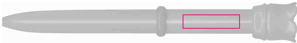
25 X 6 mm Tampographie / Padprinting / Tampografia / Tampografia