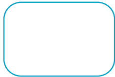
30 X 20 mm Permavision ou insert laser Permavision or laser insert Permavision o inserto laser Permavisión o insert láser