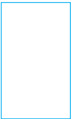
30 X 50 mm Sérigraphie / Silkscreening / Serigrafia / Serigrafía