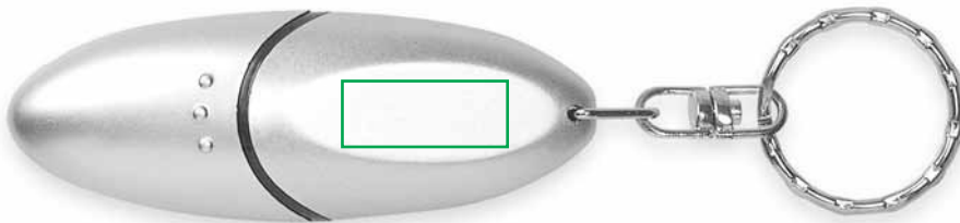
20 X 8 mm Laser