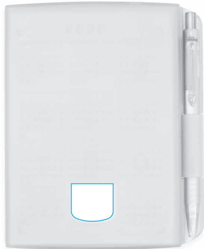
19 X 17 mm Permavision ou insert laser Permavision or laser insert Permavision o inserto laser Permavisión o insert láser