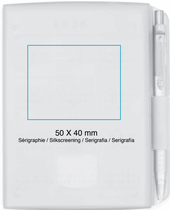
50 X 40 mm Sérigraphie / Silkscreening / Serigrafia / Serigrafía