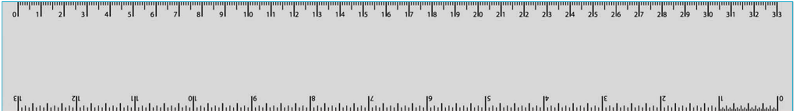
344 X 48 mm Sérigraphie / Silkscreening / Serigrafia / Serigrafia